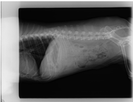
Post Radiograph on 6/29

This canine developed Peritonitis. E. coli was cultured from the fluid. No evidence for intestinal perforation or obstruction was found. IV fluids, antibiotics, and HBOT were given and the peritonitis resolved.